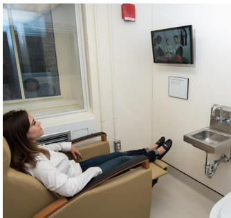
Resting metabolic rate

Indirect calorimetry monitoring of VO_2 , VCO_2 and RER for 20 hours using Sable Promethion room calorimetry system. Subject rode stationary bike for 30 minutes at hours 4 and 5. Gray shading indicates lights out phase.