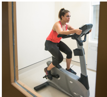
Active metabolic rate